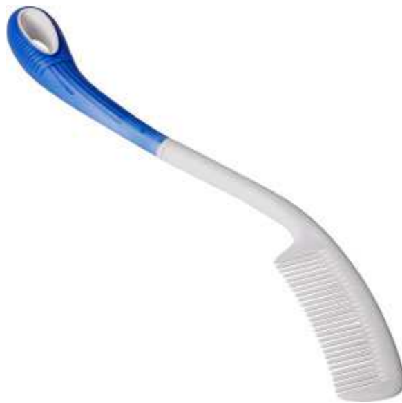
Comb, 37 cm (14 ½")

A kit containing three Beauty products is available. The perfect gift for someone you care about.