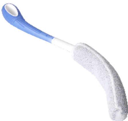
Body washer, 38 cm (15")